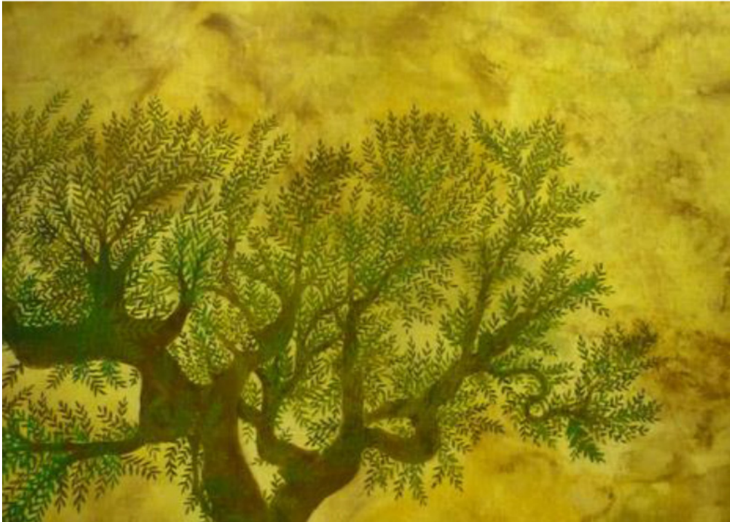
Al Saifi Restaurant