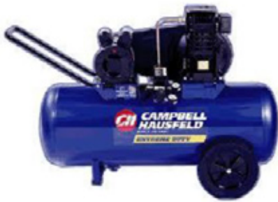
Roller & Paint Brush