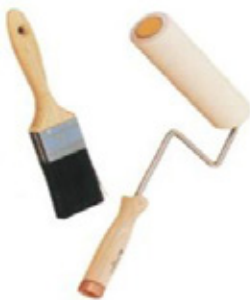
Airless Spray Gun